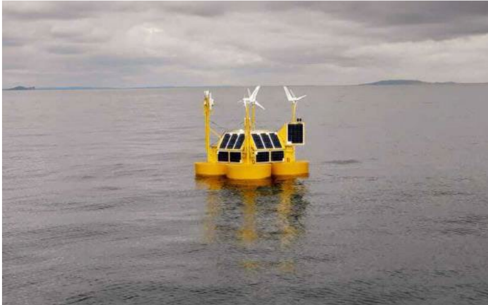
Figure 2: Broadshore FLiDAR E26